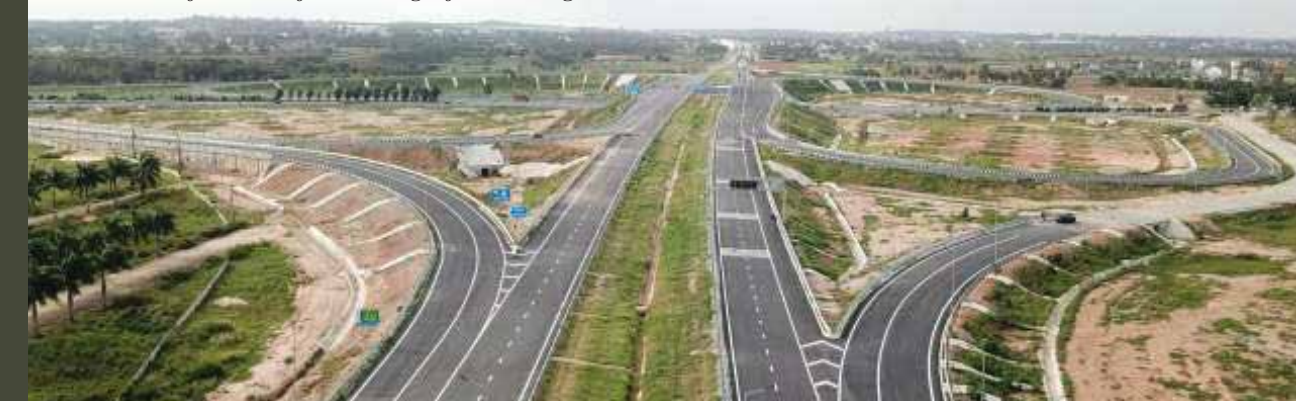
Actual shot of Cloverleaf interchange of STRR Ring Road (CBIC)

Very well connected to the major IT Hub - Whitefield