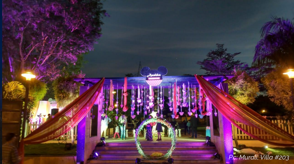
Villa #203