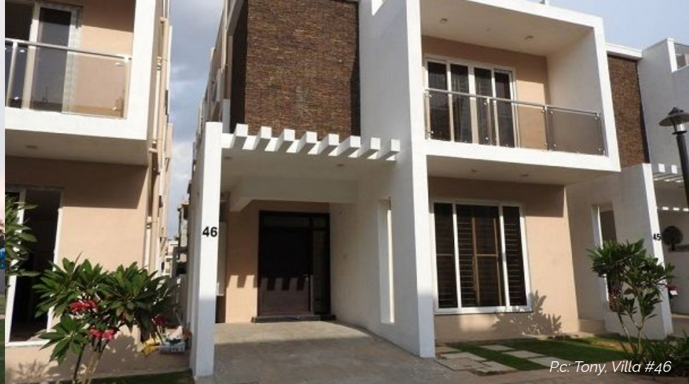
Pc: Tony, Villa #46