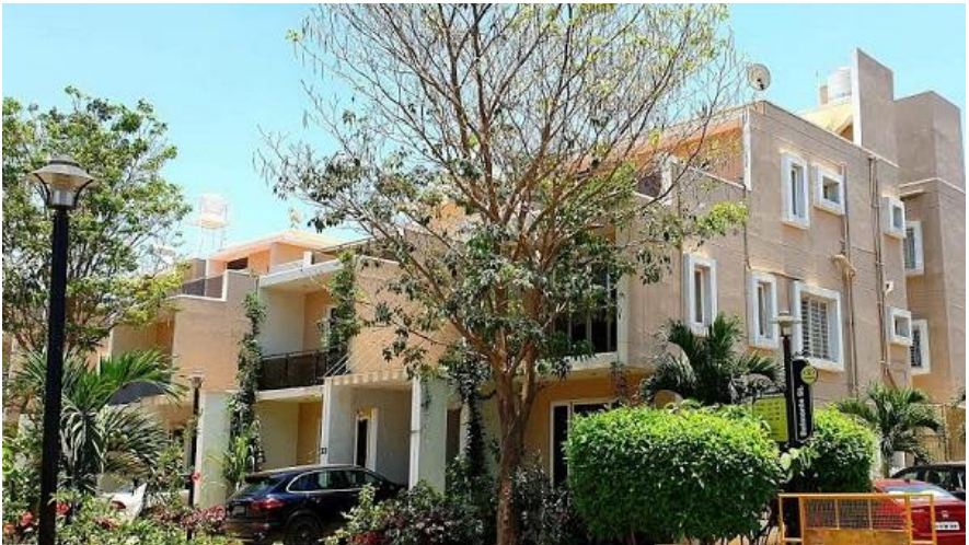
Pc: Niranjan.P, Villa #75