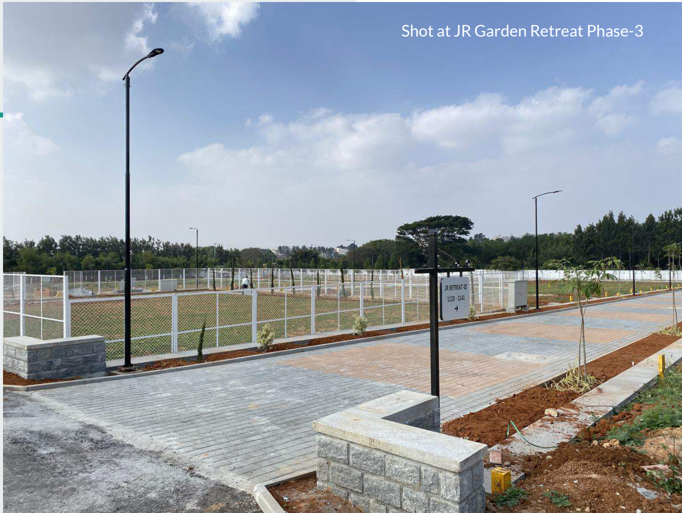
Shot at JR Garden Retreat Phase-3