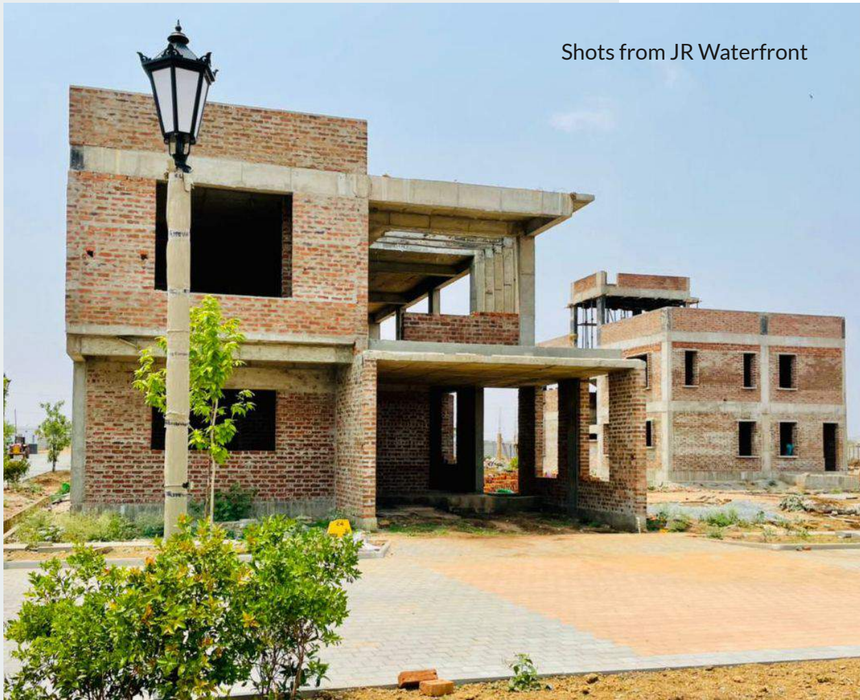
Shots from JR Waterfront