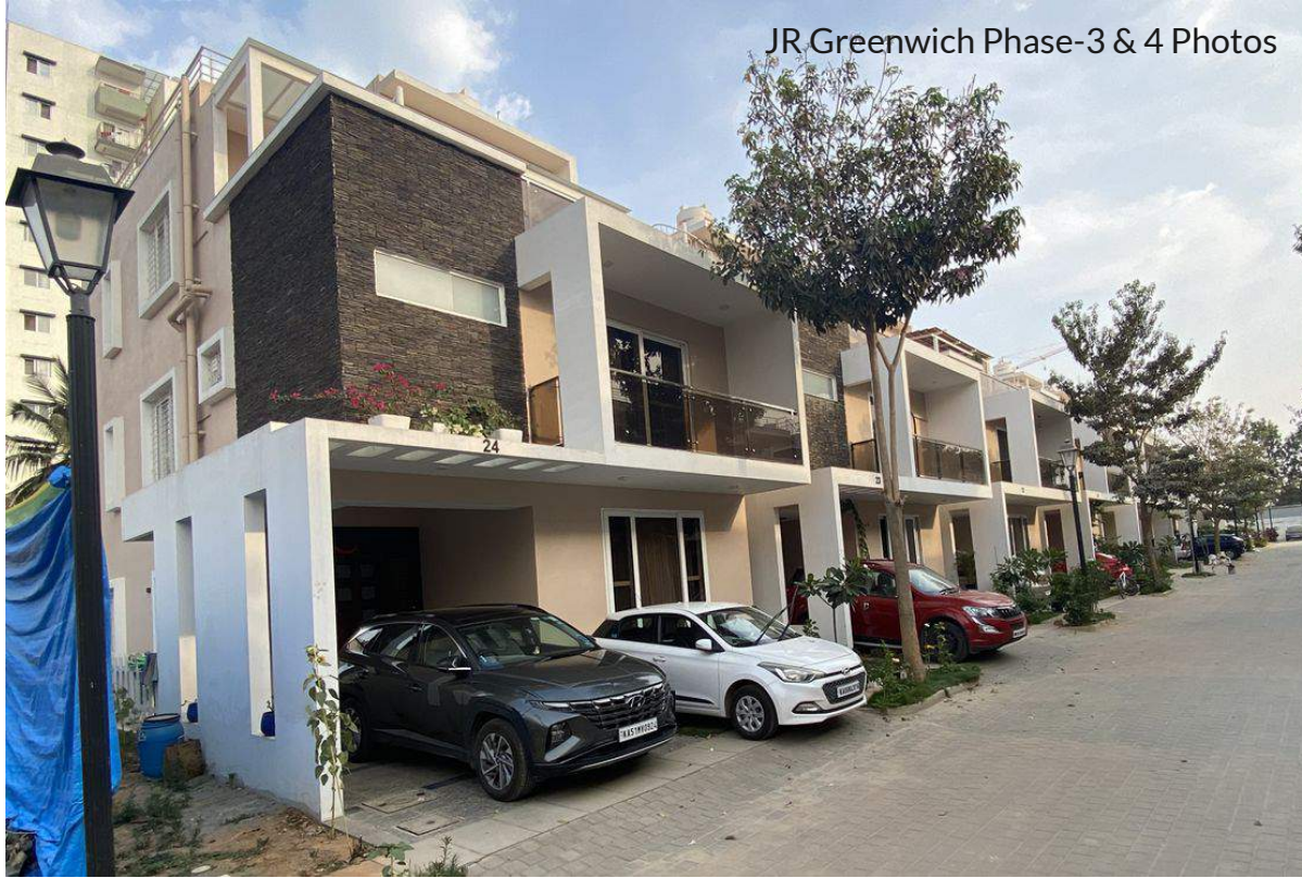
JR Greenwich Phase-3 & 4 Photos