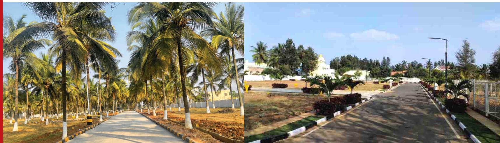
Actual Shots at Project