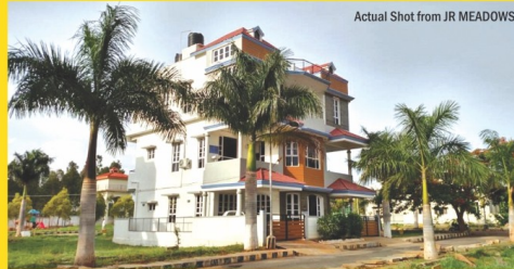
Actual Shot from JR MEADOWS