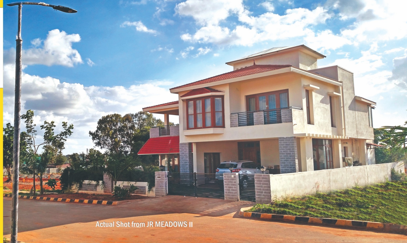
Actual Shot from JR MEADOWS II